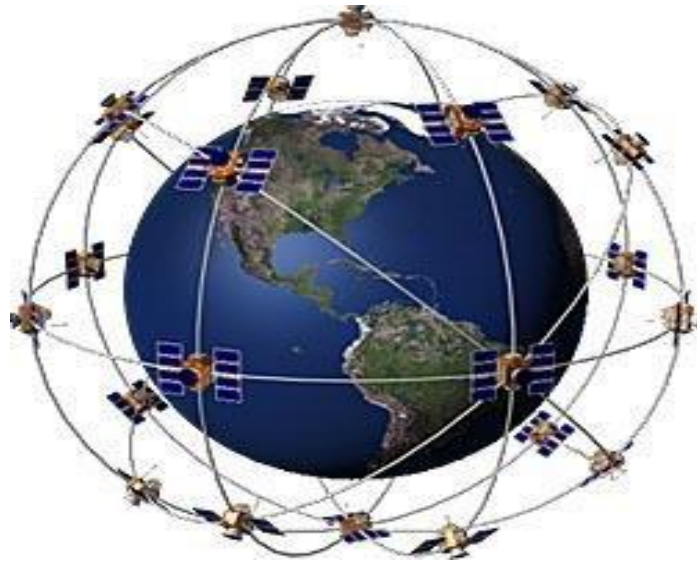
Figure 1 Network of satellites orbiting earth.

Receiver Unit Calculates Position Through Trilateration. Each satellite has a highly accurate atomic clock onboard that keeps exact time, and sends time-codes to the earth at nearly the speed of light, but there is still a fraction of a second delay before the signal reaches the surface of the earth. The GPS unit picks up the signal, and finds the distance to the satellite by subtracting the current time from the time sent from the satellite. The difference between the time code signal sent from the satellite to the current time according to the GPS receiver allows the unit to calculate distance.