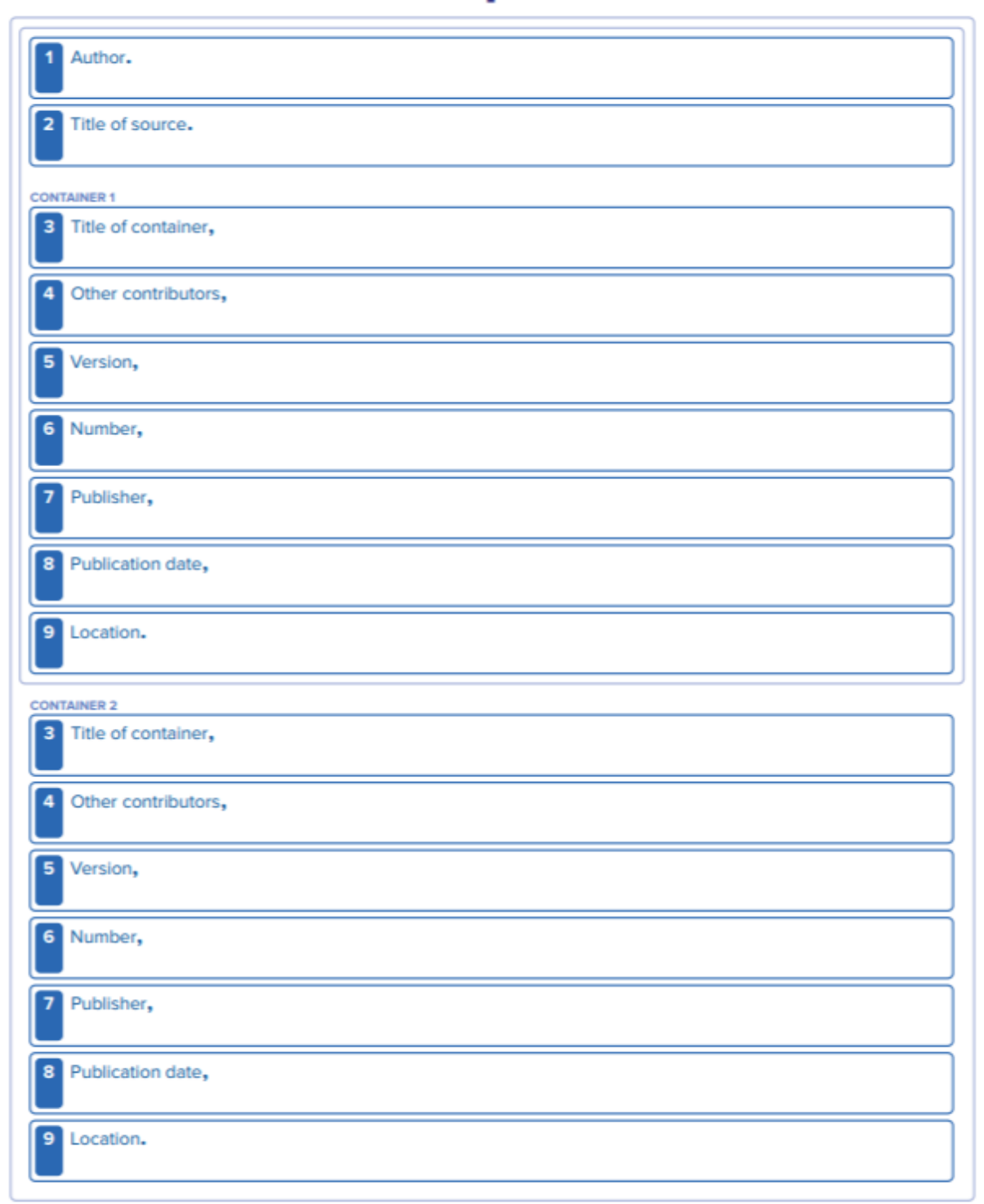
From MLA Handbook (8th ed.), published by the Modern Language Association (style.mla.org).

Use this template to record the core elements of your source. Follow the punctuation provided, using commas or periods after each element as shown. Omit any elements you can't find.