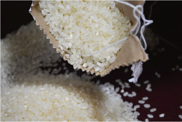
He buys rice.