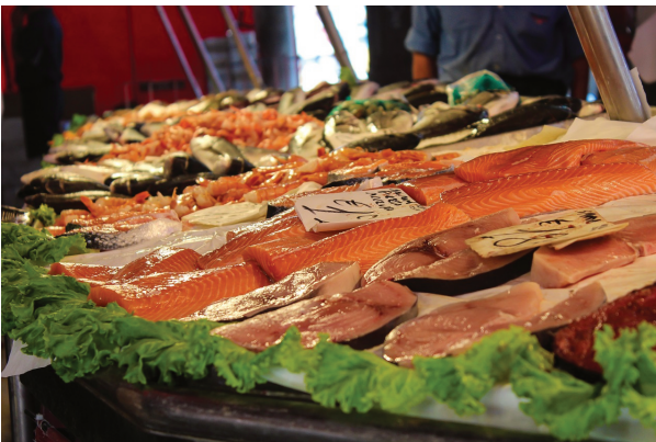
He buys fish.