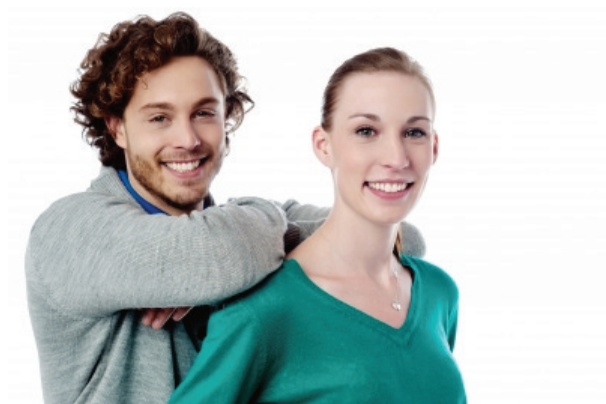
They are happy.