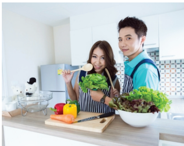
“Dinner is ready. Let’s eat!”