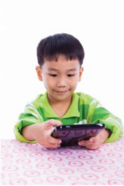
They have a son. He plays a game.