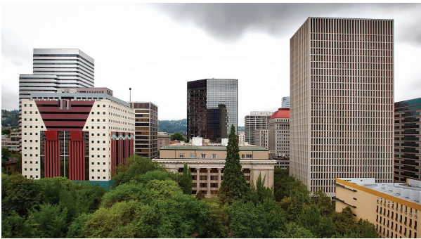
They live in Portland.