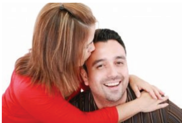
They are married.