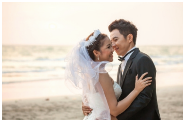
They are married.