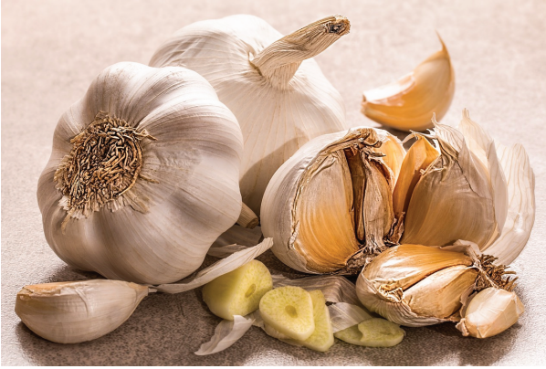
Wu buys garlic.