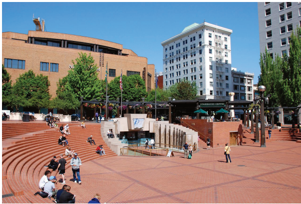
She lives in Portland. The weather is beautiful today.