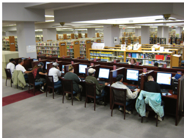
Hugo is a student. He has English class on Monday, Wednesday, and Friday.