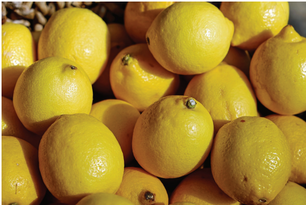
He buys lemons.