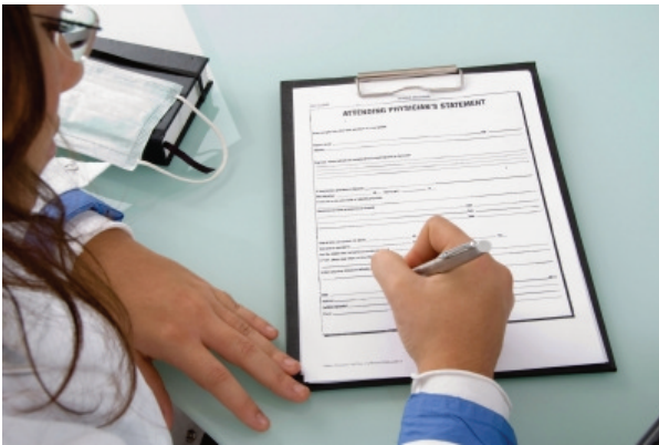
They visit the doctor's office.