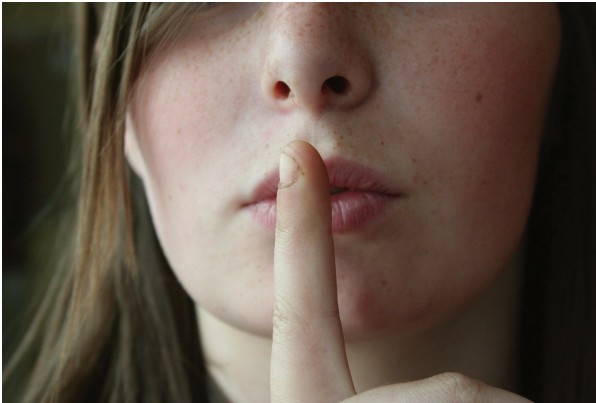
A classmate says “Shh!”