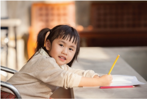
They have a daughter. She does homework.