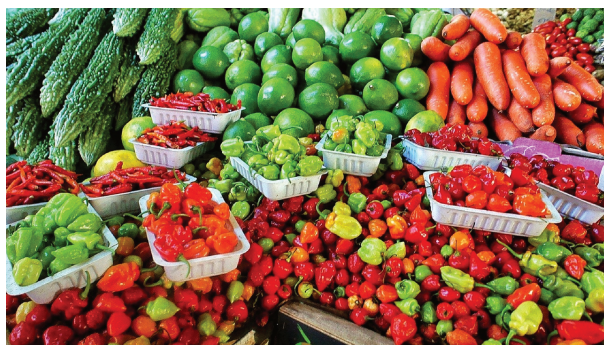
The market has many fruits and vegetables.