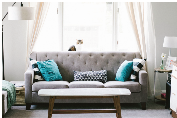
The children are in the living room.