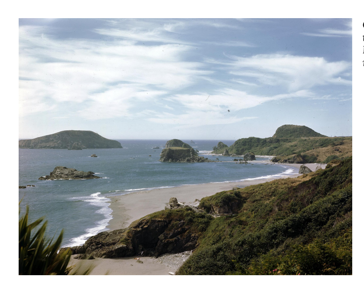
Oregon coast taken from Highway 101 near Brookings

Imagine: the year is 1913. Oregon is a young state. It is only 54 years old. Railroads are bringing more people to the Oregon Coast. Some are only visitors on vacation. Others, however, want to buy land next to the ocean. It is a race to see and build new things. What will happen?