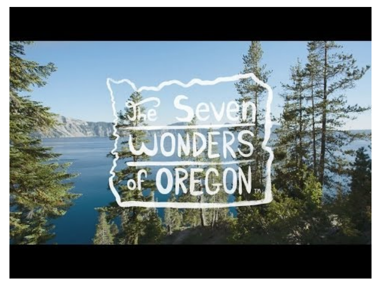
A YouTube element has been excluded from this version of the text. You can view it online here: https://openoregon.pressbooks.pub/ sevenwondersoforegon/?p=81

Oregon has many beautiful places. There are tall mountains, small hills, and unusual caves. There are green forests and brown deserts. There is the Pacific Ocean. There are also lakes, rivers, waterfalls, and much more!