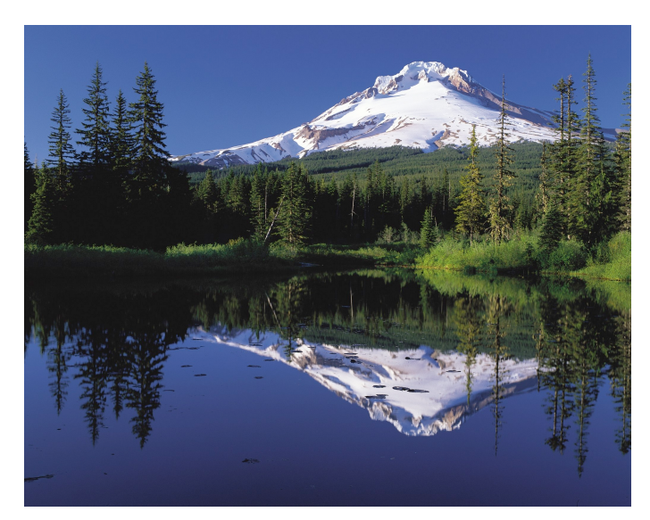
Mt. Hood Reflected in MIrror Lake

Mount Hood is a famous place to visit in Oregon. You can see the mountain from many places in the state. It is about 50 miles from Portland. You can drive from the city to the mountain in about one hour.