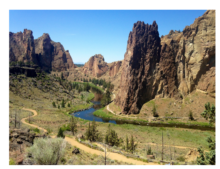
Smith Rock in the afternoon

Do you like rock climbing? Smith Rock is in the high desert of Central Oregon. It is a very popular park. People like to climb its rocky cliffs and towers. It has 623 acres, and there are many animals, such as eagles, mountain lions, and deer.