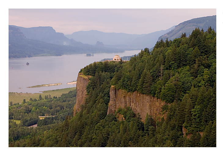
Columbia River Gorge

The Columbia River Gorge separates the states of Oregon and Washington. The word gorge is another name for a canyon. It is a deep valley between hills or mountains. A gorge usually has high walls and a river running through it.