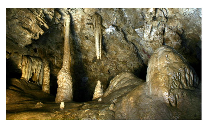
Orca Millers Chapel

Many people like to climb to the tops of mountains in Oregon. However, some people like to go inside a mountain. They like to explore the Oregon Caves.