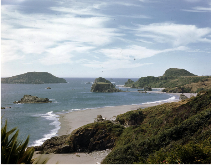
Oregon coast taken from Highway 101 near Brookings

Imagine: the year is 1913. Oregon is a young state. It is only 54 years old. Railroads are bringing more people to the Oregon Coast. Some are only visitors on vacation. Others, however, want to buy land next to the ocean. It is a race to see and build new things. What will happen?