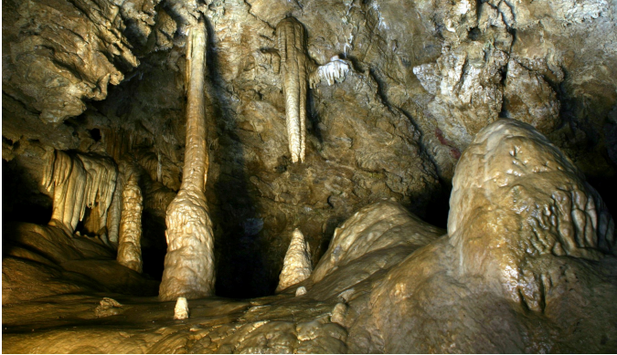
Orca Millers Chapel

Many people like to climb to the tops of mountains in Oregon. However, some people like to go inside a mountain. They like to explore the Oregon Caves.