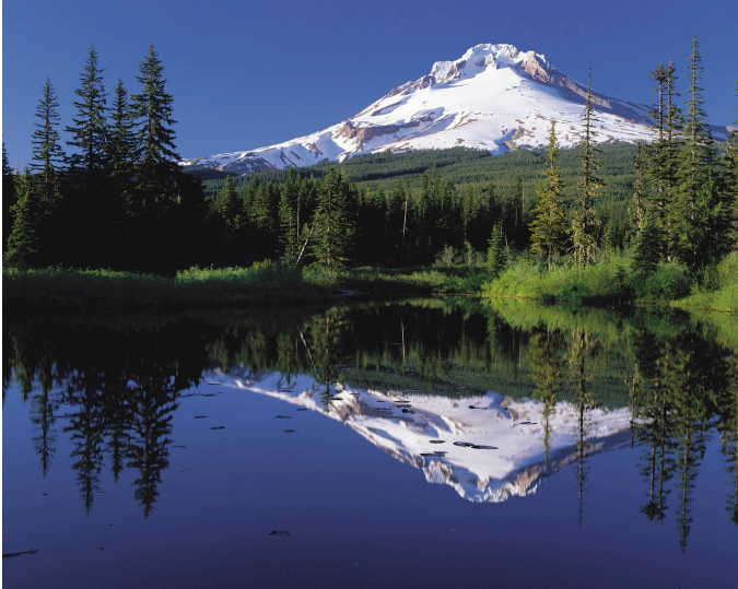
Mt. Hood Reflected in Mirror Lake

Mount Hood is a famous place to visit in Oregon. You can see the mountain from many places in the state. It is about 50 miles from Portland. You can drive from the city to the mountain in about one hour.