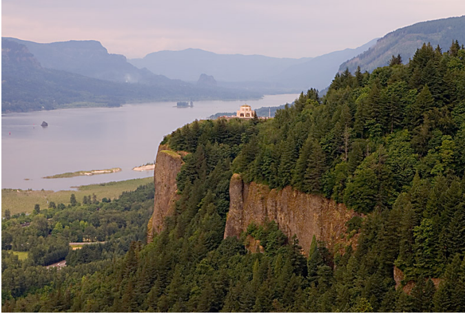
Columbia River Gorge

The Columbia River Gorge separates the states of Oregon and Washington. The word gorge is another name for a canyon. It is a deep valley between hills or mountains. A gorge usually has high walls and a river running through it.