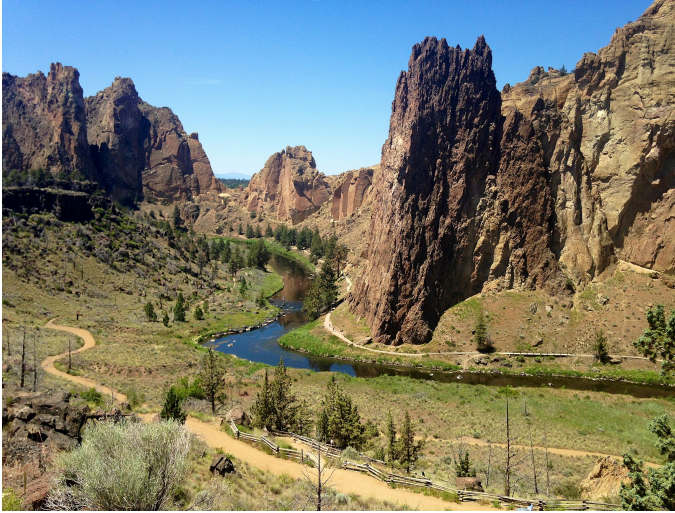
Smith Rock in the afternoon

Do you like rock climbing? Smith Rock is in the high desert of Central Oregon. It is a very popular park. People like to climb its rocky cliffs and towers. It has 623 acres, and there are many animals, such as eagles, mountain lions, and deer.